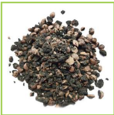
HDC 2-8 mm